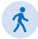
Urgent Care Centre/ Walk-in Centre