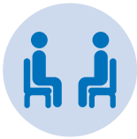
Mental Health Support