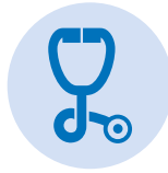
GP/GP Out of Hours