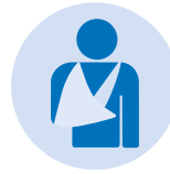
Minor Injuries Unit